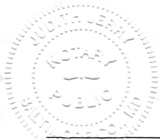
Stamp, Notary Public