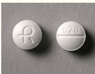
Phenobarbital (Luminal, Solfoton)