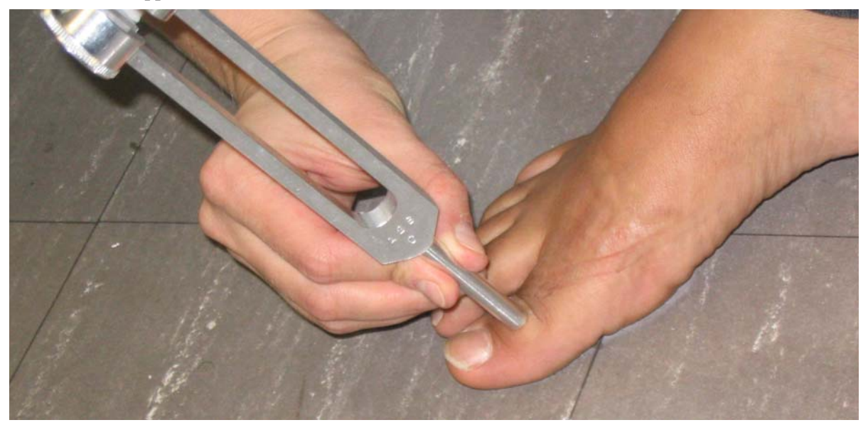
Figure 1. Testing of vibration. Press the 128 Hz tuning fork firmly (but not too hard) against the last joint of the big toe. A normal response is for the participant to feel vibration (not just pressure) for more than 10 seconds.

Once again, be aware that some participants "tune out" and this may yield a false negative result. If you have concerns that they are not paying attention, purposely stop the tuning fork and be sure they tell you the vibration stopped.